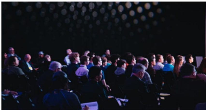
International Congress API – Advances in the Packaging Industry “Sustainability: Products and Processes”

The fourth edition of the International Congress API - Advances in the Packaging Industry “Sustainability: Products and Processes” that will take place in Naples, on 24 and 25 November 2022.